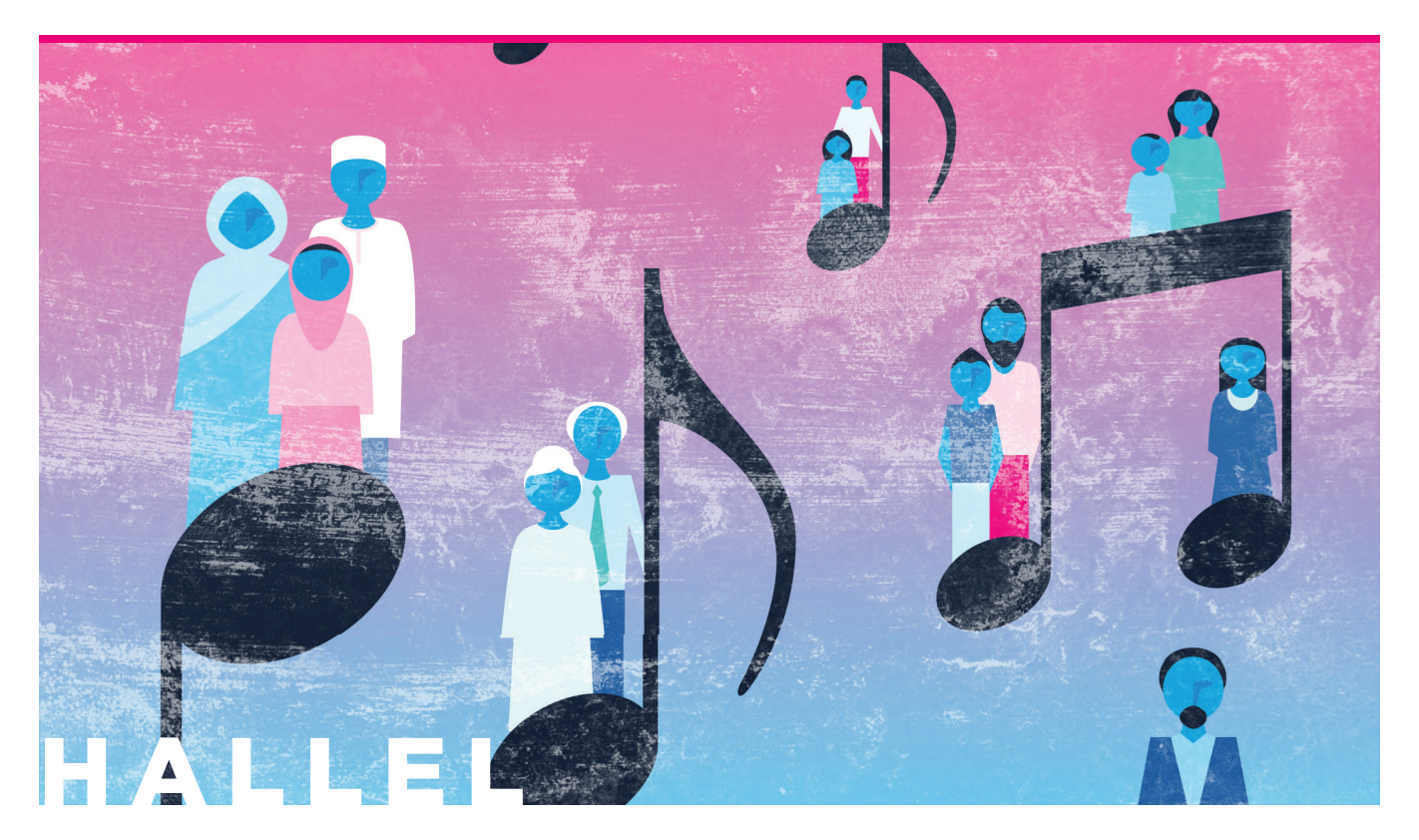
Hallel is a time to offer words of praise and song. Consider singing some of your favorite songs about justice or read the words below. You may also consider singing "Pitchu Li" before you begin the reading.