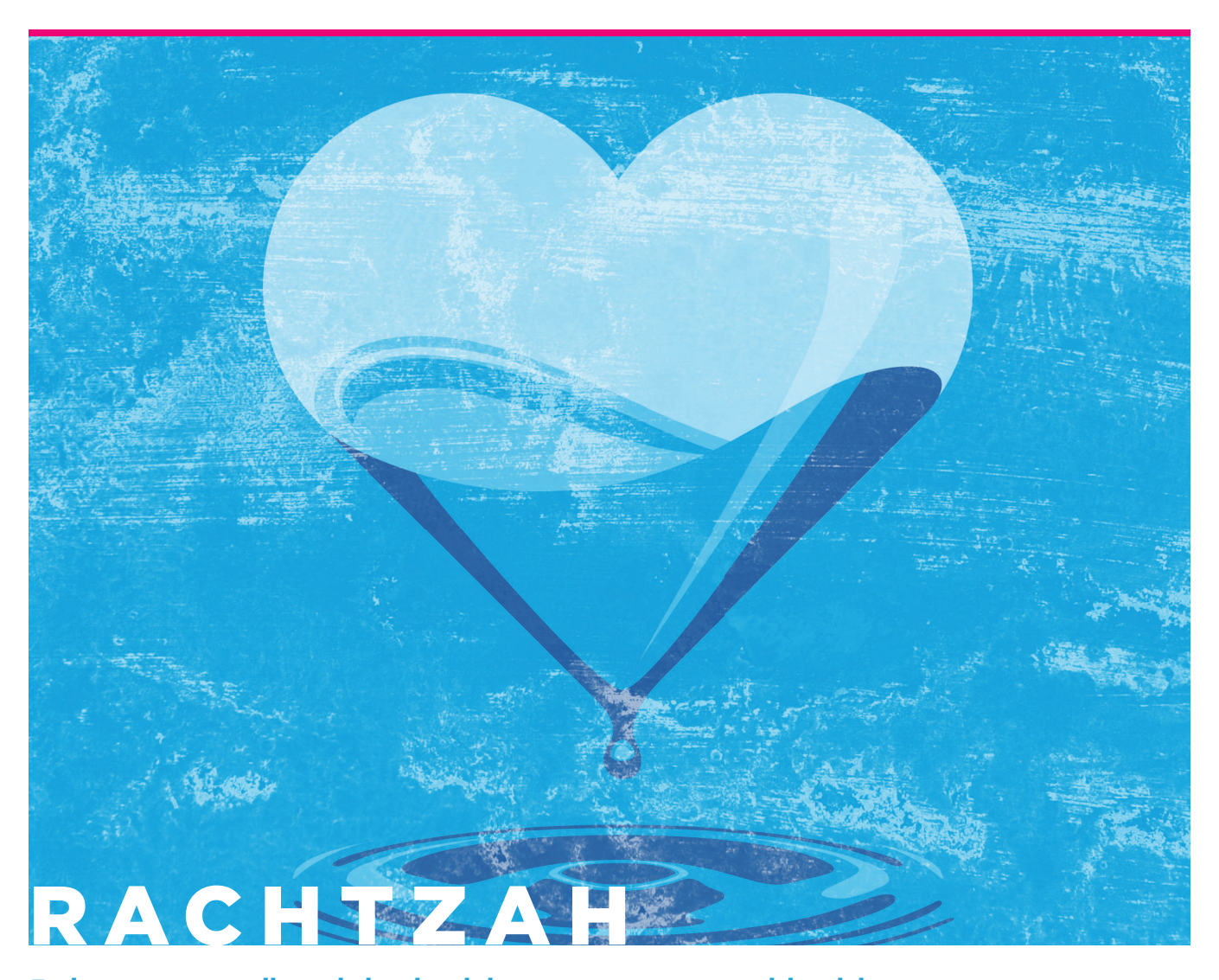
Each guest may ritually wash their hands by pouring water over each hand three times, alternating between them. Then, recite the blessing below together.

בָּרוּךְ אַתָּה יי, אֱלֹהֵינוּ מֶלֶךְ הָעוֹלֶם, אֲשֶׁר קִדְשָׁנוּ בְּמִצְוֹתָיו וצוּנוּ על נטילת ידים.